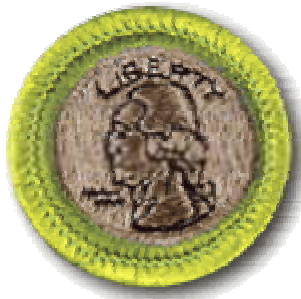
ABRAHAM CENT DOLLAR FEDERALIST FIRST GEORGE GETTYSBURG HONEST LINCOLN LOGCABIN PRESIDENT QUARTER

E J G E T T Y S B U R G F S G T N G H N M T T T W E N E R N I E P E G L H A D F L V O E B O M C W O S E R T O E F D A R F X N H R J W Q C N Y I C G N E I A D H U K N T E S G E S N L O R A Q L I E L E O T G I L F R Q Z L L E L R L T S L I T J W L B L N A P O T A R E V T T Q N H T V N R R S R K M B T T T Y H H X Q T M A H A R B A R K M C