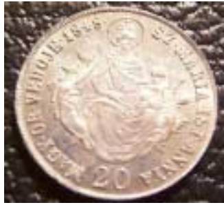
1848 20 Krajczar, Hung. Ins.

Although very similar in appearance due to the design, 20 krajczars of 1848 came in two distinct varieties. The first one bore the traditional Latin titles of the king, and of the Madonna and Child, along with the mintmark 'B' for Koermoerczbanya. The later issue is the first coin in Hungary to use the Hungarian language on a coin, a practice which resumed when specifically Hungarian coins were again struck in 1868. The titles of the reigning monarch are changed somewhat as well, the Latin title "Ferdinand I by the Grace of God Austrian Emperor, King of Hungary and Bohemia Fifth of That Name, King of Lombardy Venetia, Dalmatia, Galicia, Lodomoeria, Illyria, Archduke of Austria". The Hungarian issue read "Ferdinand V King of Hungary, Croatia, Slovakia, Grand Prince of Transylvania", and the Madonna and Child reverse is the same in both languages — "Patroness of Hungary".