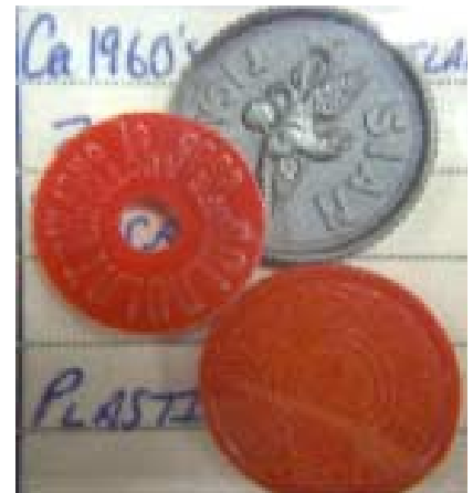
Plastic Coinage from Siam