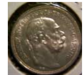
1912 Franz Joseph 2 Korona obv.