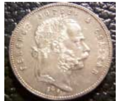
1868 Silver Florin Franz Joseph