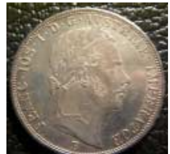
1859 B Two Florin Franz Joseph