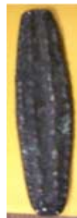
18th Century Tiger Tongue Money from Siam