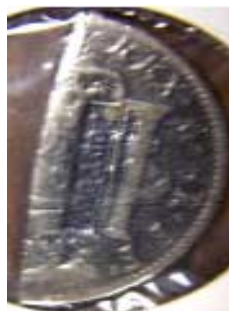
Cut Pillar Dollar