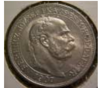
1907 Franz Joseph 5 Korona, obv. and rev.