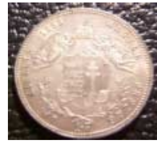
1868 Silver Florin, Franz Joseph rev.