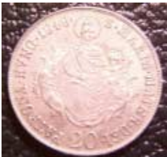
1848 20 Krajczar, Latin ins.

Franz Joseph I had a long and varied coinage throughout his 68 year reign, which embraced a number of systems, starting with the old thaler system, the decimal and vereinsthaler series, which lasted until 1868, the florin-krajczar series until 1892, and lastly, the korona-filler system which remained in use until 1922. A number of portrait styles depicting him as he aged were used, as were a number of changes in the depiction of the coats of arms on the coins.