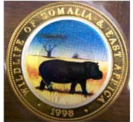
Somalian Appliquéd Coin