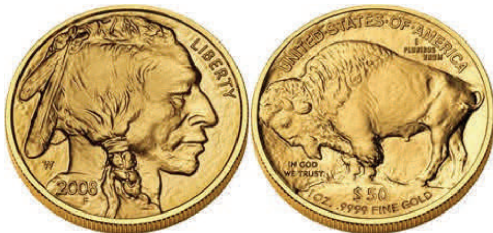
2008 Gold Buffalo Fractionals

Remember, if you plan to place items for auction at the following meeting, send the details to andrusrex@gmail.com by the third Monday of the month and I will publish them as space permits. A copy of the Auction Sheet is attached at the end of this newsletter.