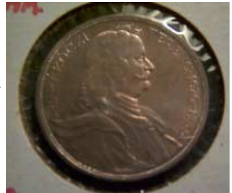
1935 2 pengo Rakoczy obverse