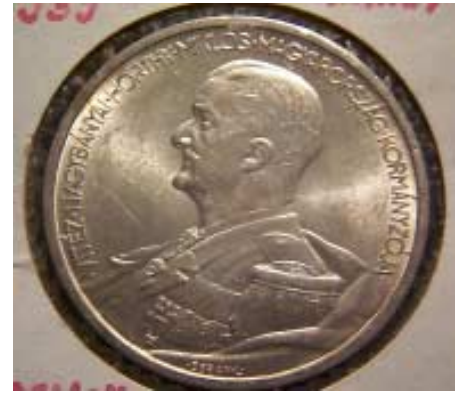
1932 5 pengo obverse