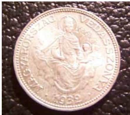
1932 2 pengo obverse

The "regency" period on Hungary lasted from 1920-1944 when the regent, Admiral Miklos Horthy, was deposed by the Nazis after his unsuccessful attempt to negotiate a peace with the Allies. Although the post-1920 Hungarian government was organized along monarchial lines, the Allied powers refused to let the last Habsburg king, Charles IV, or any other member of the Habsburg family, resume his royal office. As a solution to this problem, the era of "the kingdom without a king" commenced when Miklos Horthy, former Austro-Hungarian naval officer and aide de camp to Franz Joseph I was elected as regent until such time when there would be a king, whether it was Charles (who died in exile in 1922) or his son, Otto. The designs of the coin of this era reflected motifs that had been used for centuries, while Admiral Horthy himself was commemorated on three different issues. This 1939 issue two pengo features the Madonna and Child, and the other features a portrait of Ferenc Rakoczy II, leader of the 18th century struggle for Hungarian independence from 1703 to 1711.