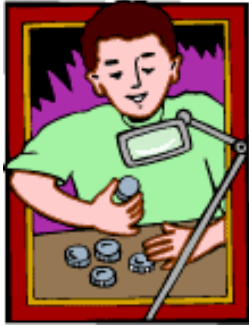
Excerpt from the June 2002 issue of The Numismatist -