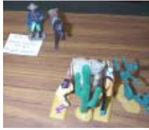
Black Cavalry fought Apaches (9th U.S. Cavalry)