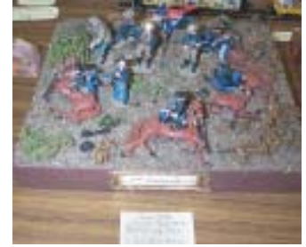
General Custer defeated at the Battle of Little Big Horn