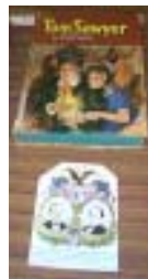
Mark Twain wrote "Tom Sawyer"