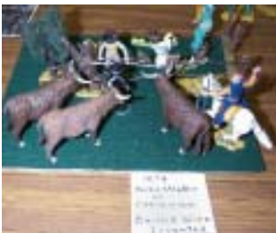
Homesteaders and the invention of barbed wire