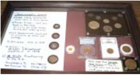
Examples of coins from the 1870s