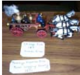
Chicago fire and Peshtigo, WI fire - 1871