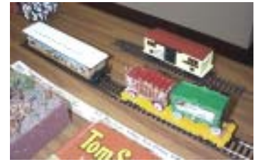
P.T. Barnum took his circus to the railways