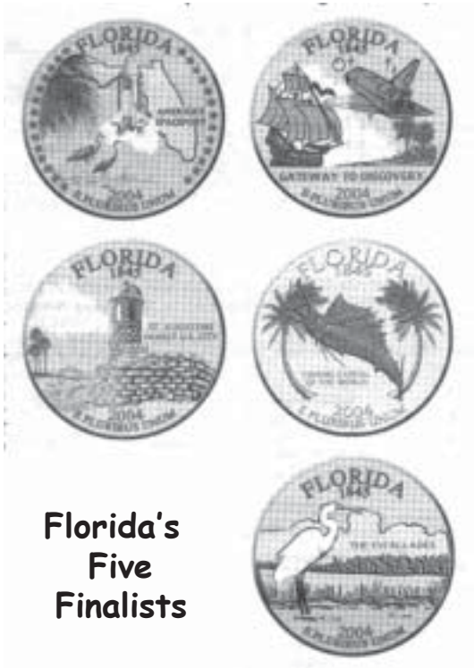
Florida's Five Finalists